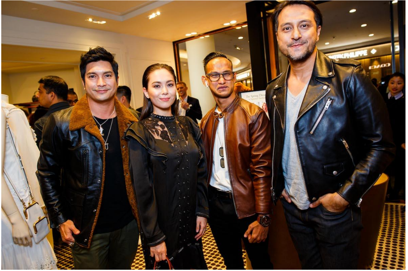
Keith Foo, Siti Saleha, Ridzuan Puzi and Bront Palarae